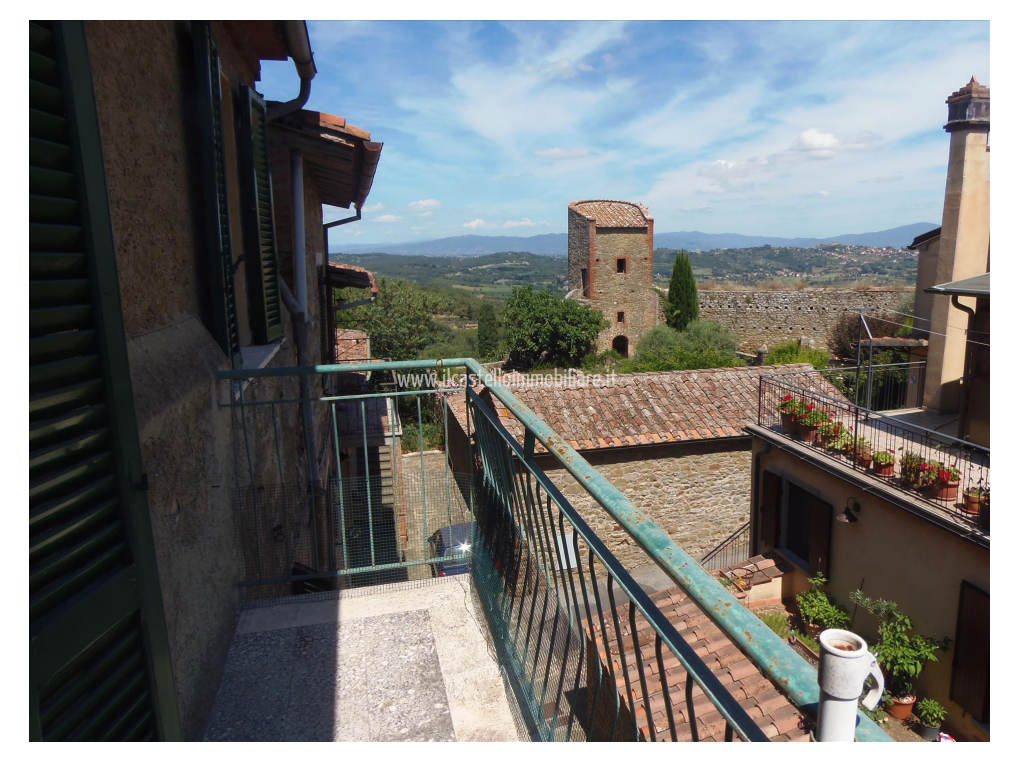
Size : 150 sqm Rooms : 7 Bedrooms : 3 Bathrooms : 2 Garage : Single Energy class : G IPE : 543,27

SINALUNGA (SI), at an altitude of 411 m above sea level. in the characteristic village of Rigomagno, for sale townhouse on 3 levels with a cadastral area of 150 m2 to be renovated internally and with a newly redone roof! Panoramic view from the balcony towards the East. On the ground floor there are two large cellars with closets and oven (one of which can also be used as a garage for a small car), on the first floor 2 rooms, closet and bathroom, on the second floor hallway, living room, kitchen with balcony, bedroom and bathroom. Original wooden floors and bricks, mostly original terracotta floors. The property is currently equipped with an independent oil heating system with a boiler room on the ground floor. The external window frames are made of wood, simple glass and wooden shutters. Easy parking possibility just outside the village walls. By moving just a few partitions it will be easy to create 3 bedrooms and three bathrooms, creating a living area on the second floor and a sleeping area mainly on the first floor (see plans with suggestions for modifications attached to the announcement). Request Euro 79,000 negotiable. (Energy Class: G and IPE: 543.27 KWh/m2year). Ref.: TT234